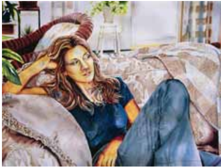
A Quiet Afternoon, 22"x30"

Jack Richeson paper as she finds it never needs stretching and always lays flat. Therefore the paper needs no staples and allows her to paint to the deckle edge, nice advantage if she wishes to float the painting when framing. The gesso allows easy lifting of paint, so she feels she can't get into too